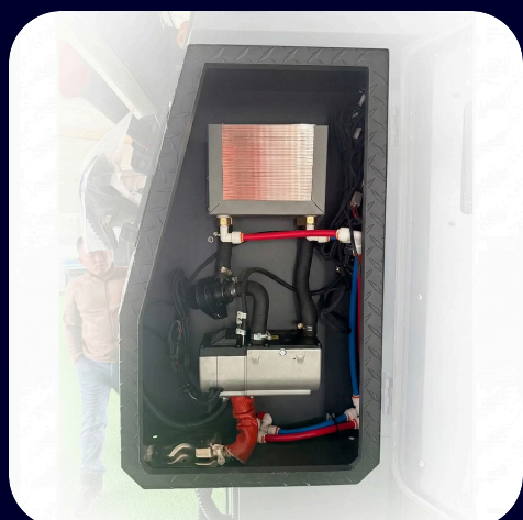
Belief Diesel Water Heater (with panel)