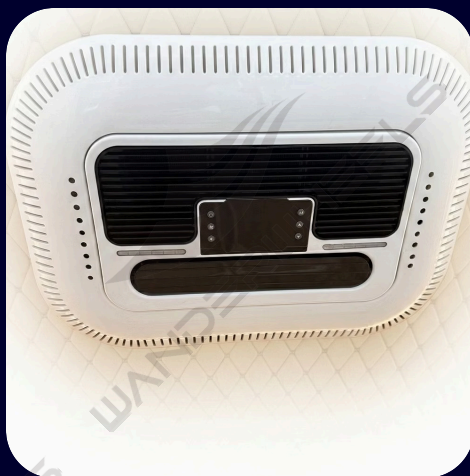
Roof AC — 12V YIERFU 2100W Cooling