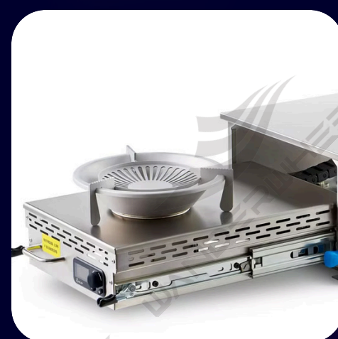
Belief Silent Slide-Out Stove