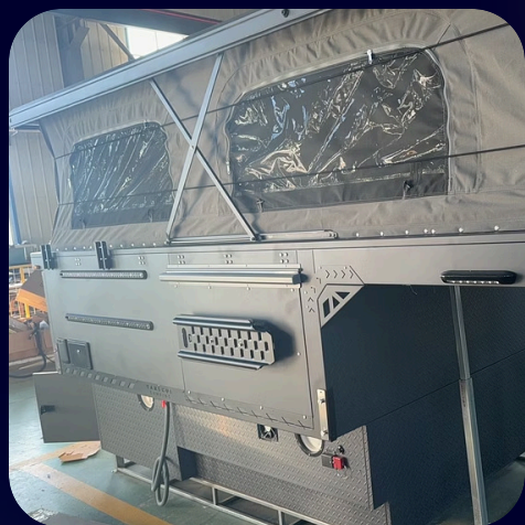
Body Extension (per 100mm over 1700mm bed)