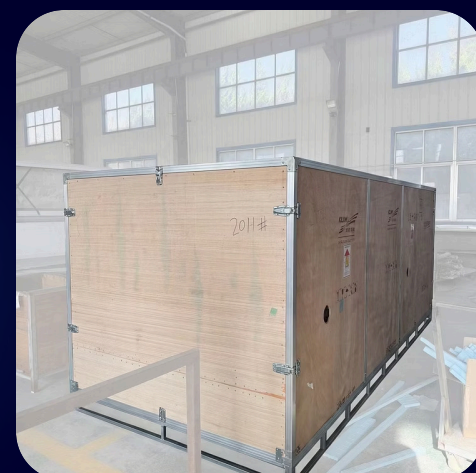
Wooden Crate Packaging (LCL only)