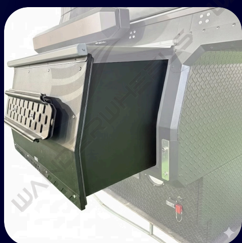
Left Expansion (50–60cm storage + awning)