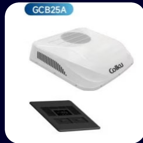
Roof AC — 220V Colku 2300W Cooling/Heating