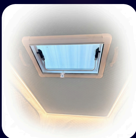
Skylight 70×50cm, sunshade + LED