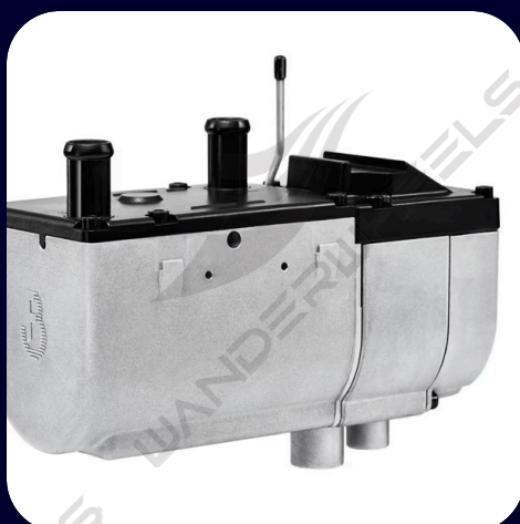
Upgrade to Belief 2kW Diesel Heater